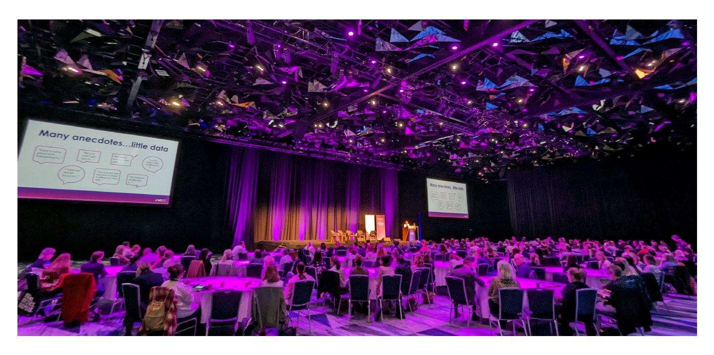
Organisational Response to Workforce Wellbeing, September 2023

A key development in 1H FY24 for the coding-focused area of Beamtree, was the extension of our strategic partnership with Lean Business Services in October 2023, an e-health company in the Kingdom of Saudi